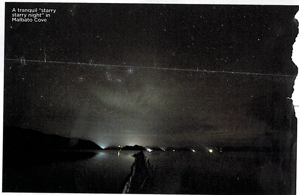
A tranquil "starry starry night" in Malbato Cove

The park is home to a staggering 83 species of birds, including seven species of kingfisher. Kayaking is a great way to see the wildlife and is best done in the